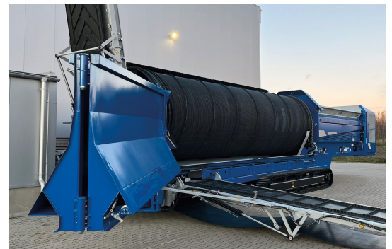
Foldable Double Door