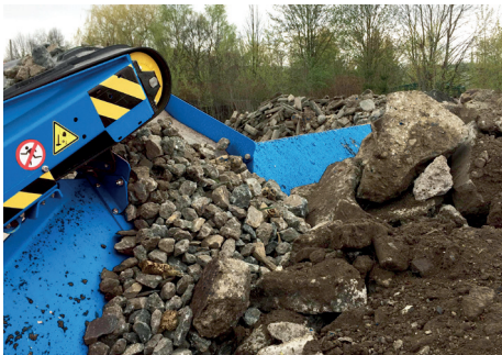
Oversize Material Return