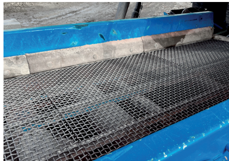
Modular Screen Deck