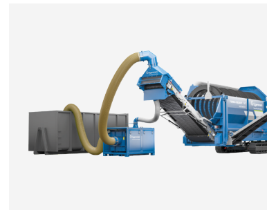
TERRA SELECT Trommel Screen Machines